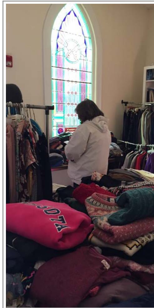
Right: Assembled donations for All Saints of America’s clothing drive.