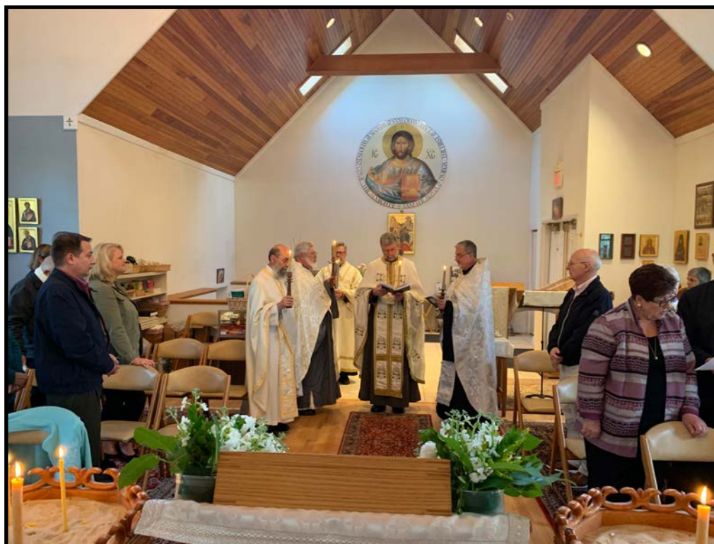
Right: Celebrating the eve of the feast day of St. Alexis in Clinton, Conn.