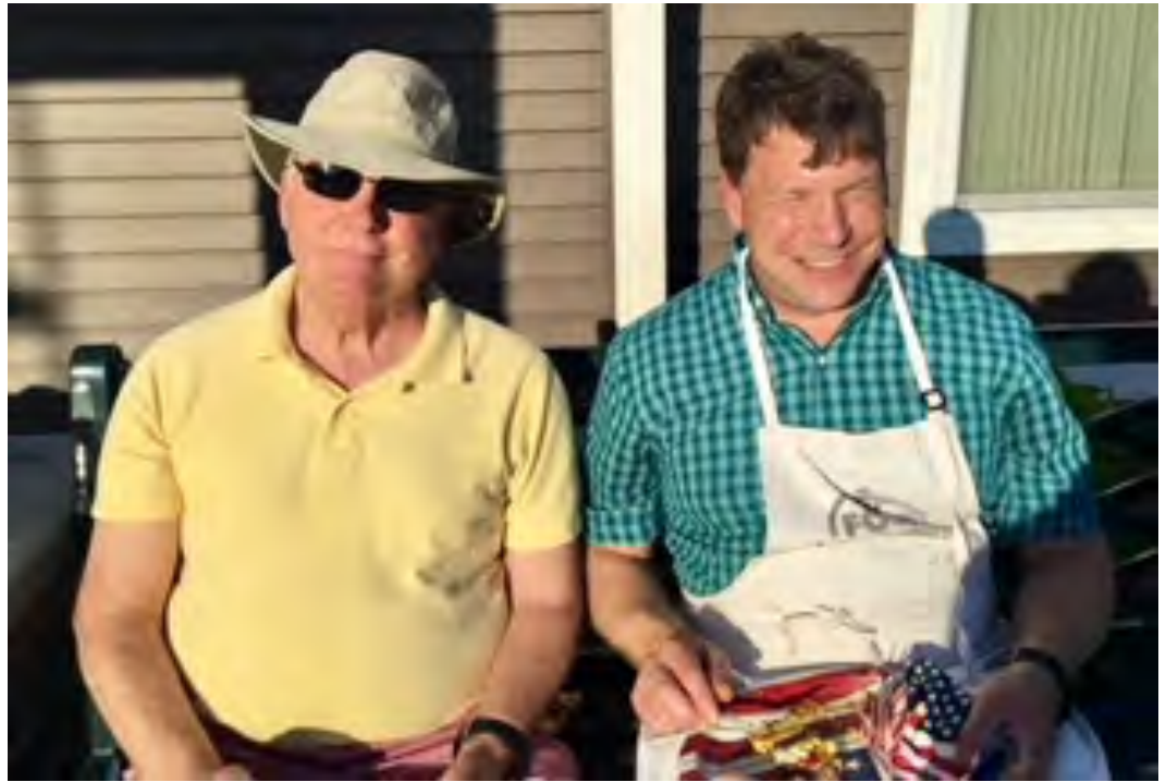
Above: Members of All Saints, Hartford, enjoying their meal after serving the barbecue.