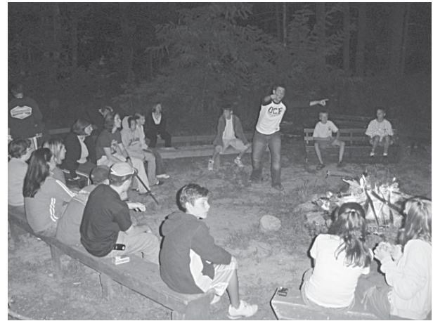
Campfire at Rally