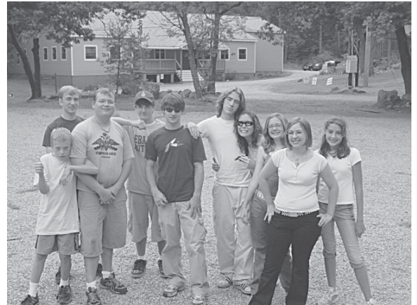
Some of the Rallyers and staff.