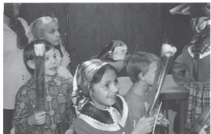
Some of the children visiting from Mercy House in Russia after a concert in New Haven.

The children performed a concert of Russian Sacred