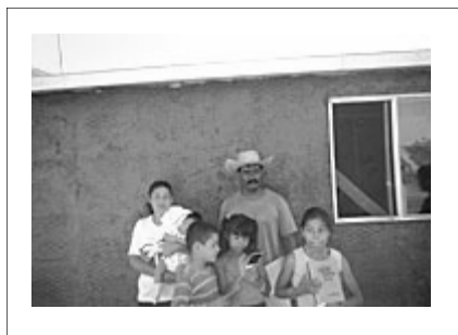
Project Mexico builds homes for the poor